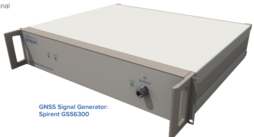
GNSS Signal Generator: Spirent GSS6300

The GSS6300 GPS/SBAS performance is equivalent to Spirent's proven GSS6100 Single Channel Production Test System. In addition, the GSS6300 offers QZSS, GLONASS, BeiDou and Galileo test capabilities to support your evolving GNSS testing needs