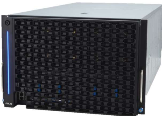
ESC N8-E11 with Front Bezel (Optional)