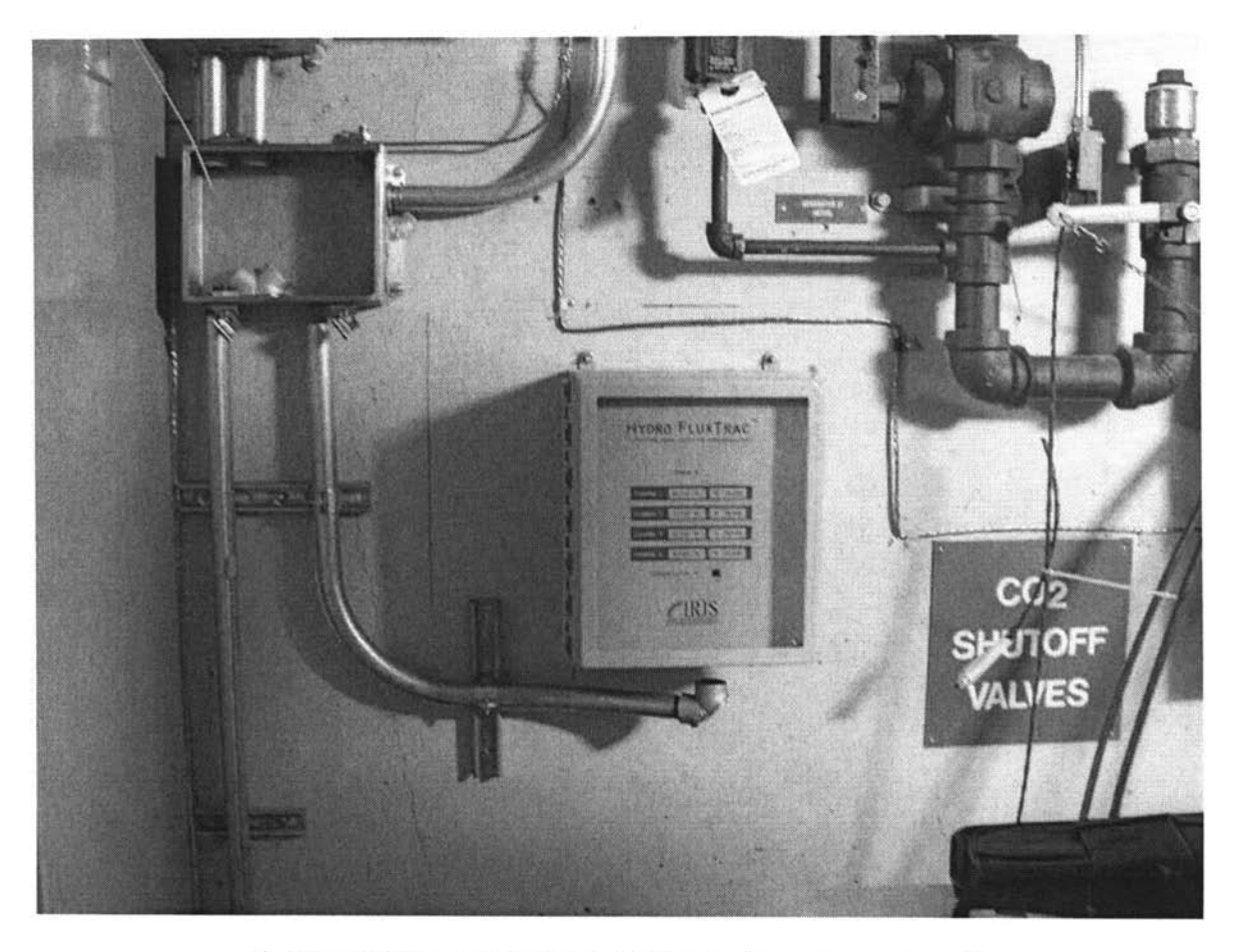
Photograph of the prototype monitor that continuously monitors the magnetic flux signals of salient pole rotors to detect shorted turns.