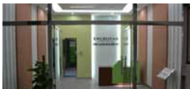
LED Center of Excellence in Shenzhen, China