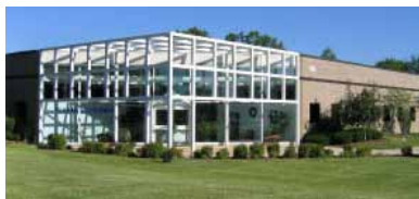
Wheeling, IL, USA