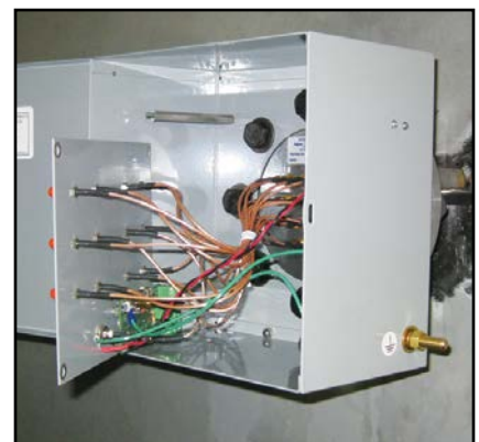
Iris Power Stator Slot Coupler, Iris Power TGA-S and Iris Power TurboGuardII are trademarks of Qualitrol-Iris Power.

QUALITROL-IRIS POWER HAS BEEN THE WORLD LEADER IN MOTOR AND GENERATOR WINDING DIAGNOSTICS SINCE 1990, PROVIDING A FULL LINE OF ON-LINE AND OFF-LINE TOOLS, AS WELL AS COMMISSIONING AND CONSULTING SERVICES.